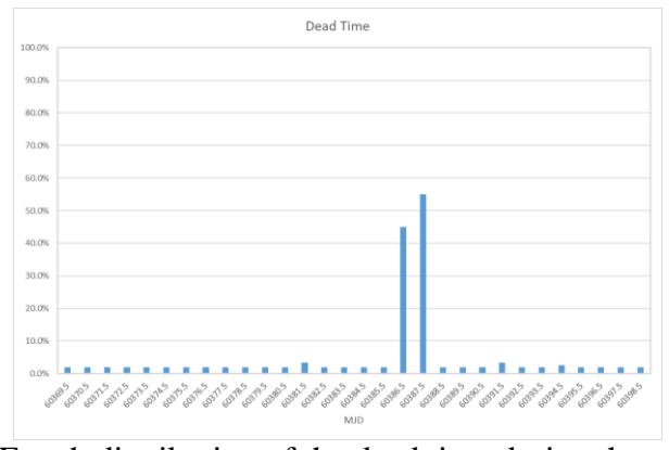
Figure 2. Epoch distribution of the dead time during the present evaluation.

The ItCsF2 uptime during this evaluation is 94.8% and the epoch distribution of fountain dead time is reported in Figure 2.